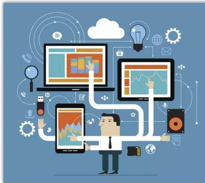
Figure 1 The impact of internet age on society